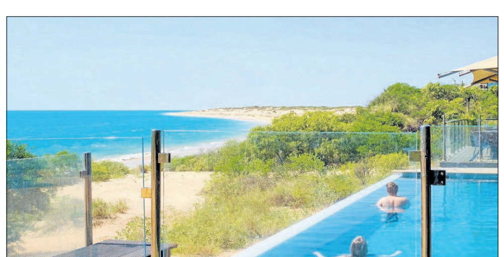
SPOILT FOR CHOICE : Take your pick - the expanse of beach or the infinity pool looking out over the Indian Ocean.

hardships at the hands of European settlers during the early 1800s.