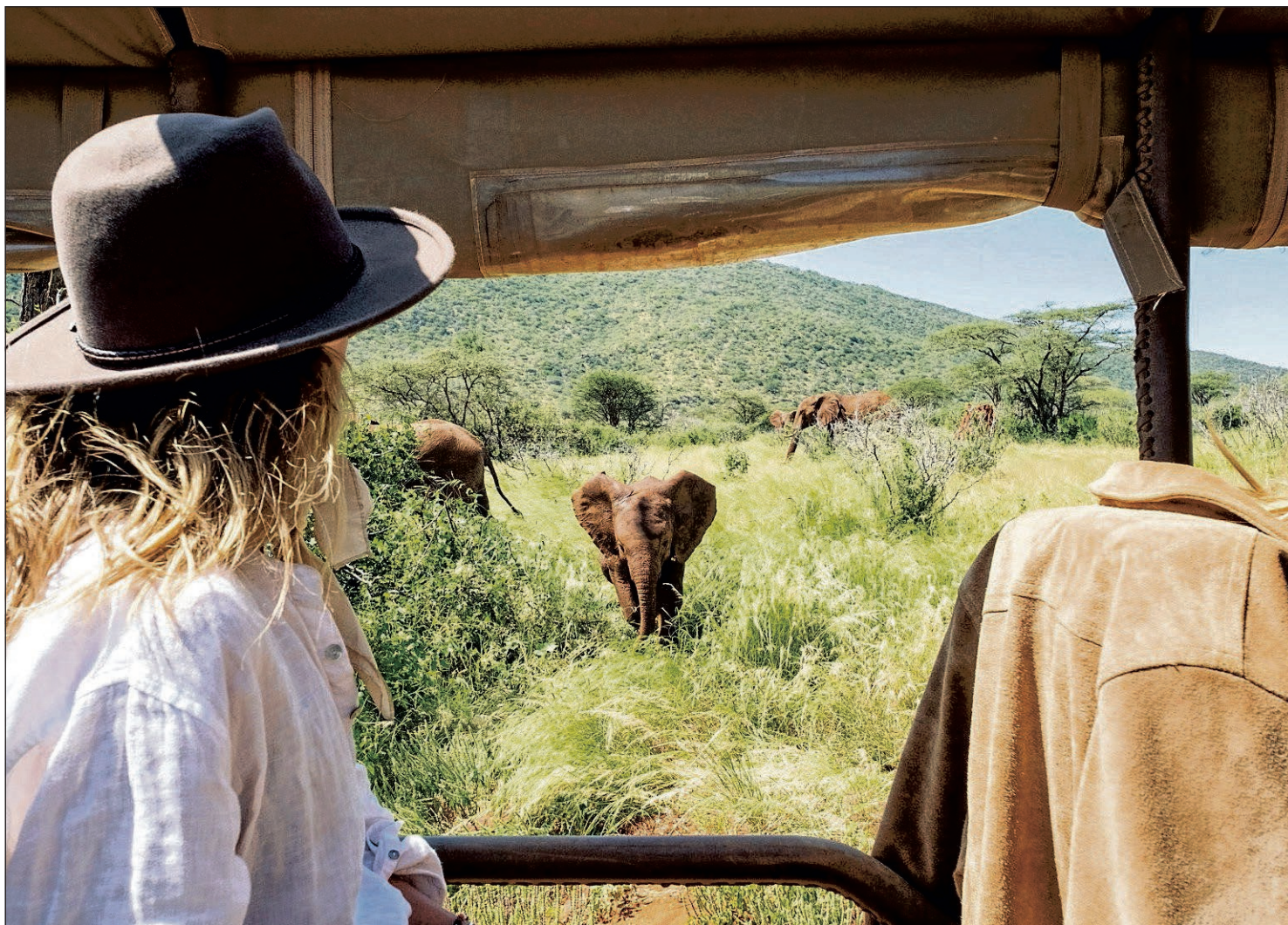
JUMBO-SIZED ADVENTURE: Elephants graze undisturbed in the long grass.