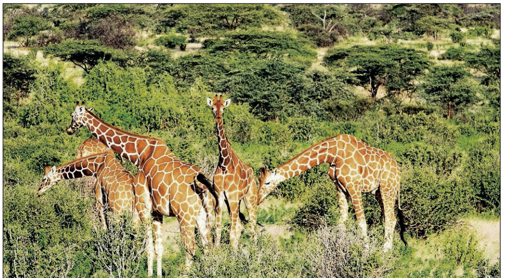
SEE ME NOT: Reticulated giraffes resemble dry cracked earth with their joined-up white lines, which provide camouflage against predators.

ear-piercing trumpet-like scream. Flapping her ears she kicks up the earth behind her as she charges at the lioness, standing metres from our 4WD. The lioness takes off at speed and for several minutes afterwards, the elephant paces, unsettled. Protecting her young is instinctive and here in the savannah survival is not guaranteed.