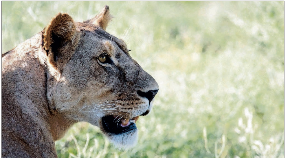
ON THE PROWL: A lioness watches and waits for her chance around a herd of baby elephants.

Our stationary open-sided vehicle is surrounded by the herd. Alarmed by the lion's presence, the matriarch produces an